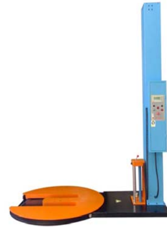
Automatic shrink wrapping Machine