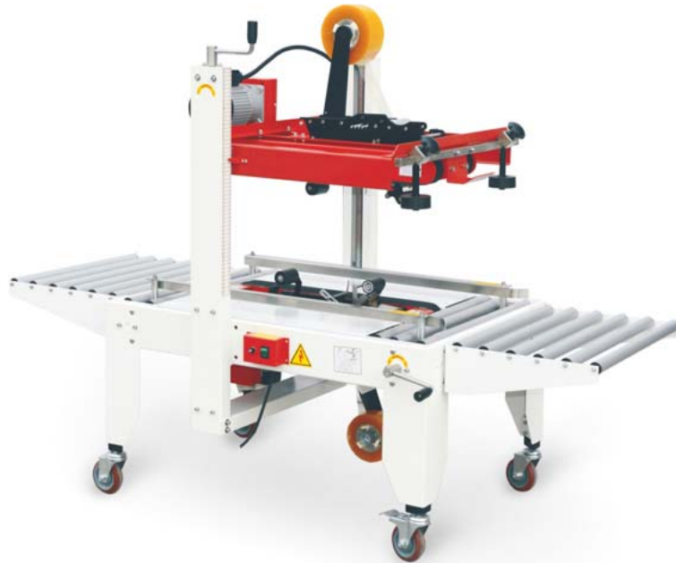
Upper and Lower Driving Sealing Machine