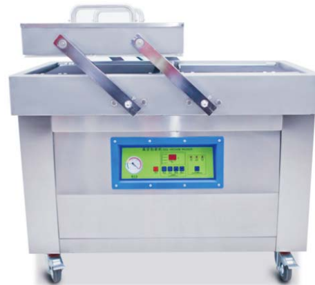
Double Chamber Vacuum Packing Machine