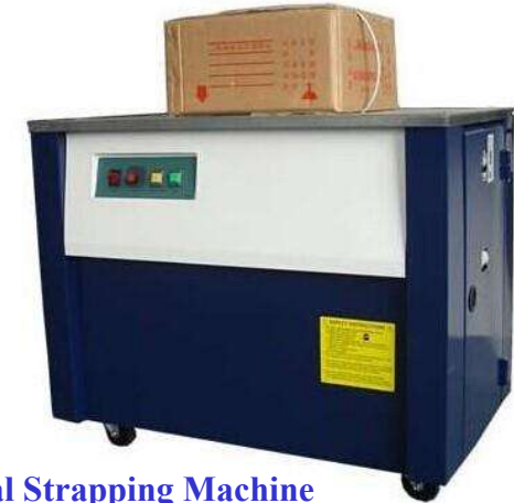
Manual Strapping Machine