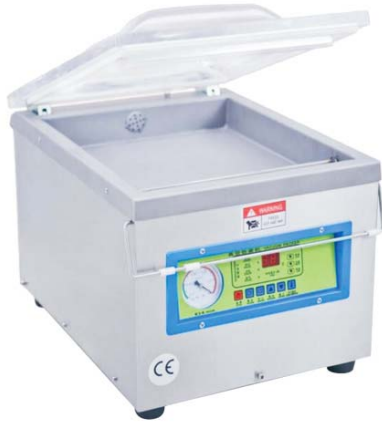
Vacuum Packing Machine