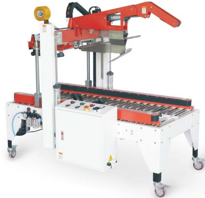
Automatic Folding Sealing Machine