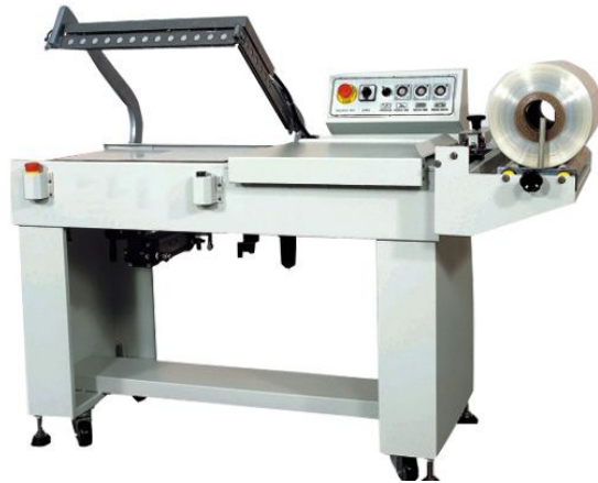
Sealing and Cutting Machine